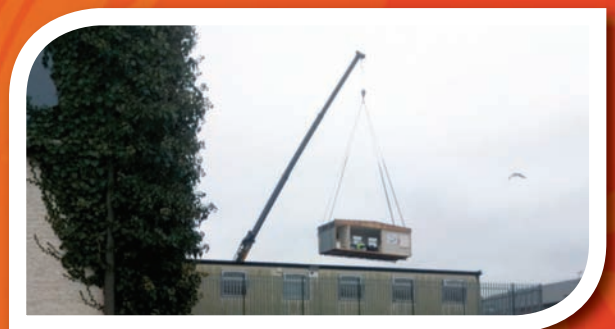
Moving the old to make way for the new