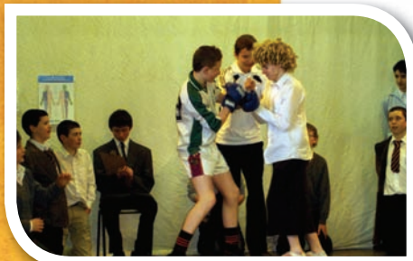
A scene from 'Ernie's Incredible Illucinations'

The whole day was full of talent and laughter, drama and emotion, which we all really enjoyed.