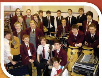
All the acts at rehearsal