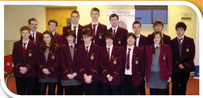
John Paul II Awards Participants