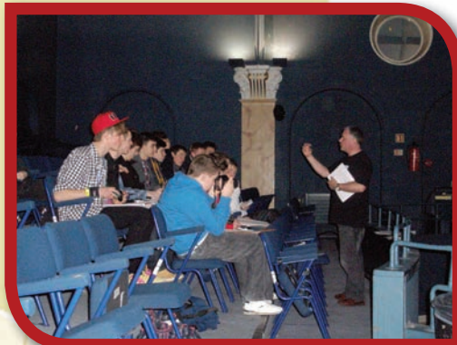
Year 12 Performing Arts Students at the Opera House

Year 12 Performing Arts students had the great opportunity to visit Newry Town Hall in January, during pantomime season. They had unprecedented back-stage access and the opportunity to interview lighting and sound engineers and even cast members.